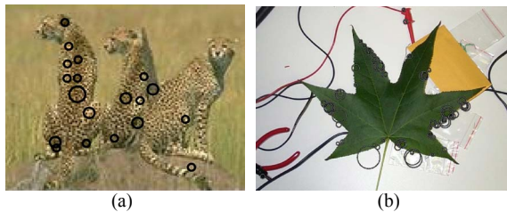
Figure 2. Examples of highly evaluated regions