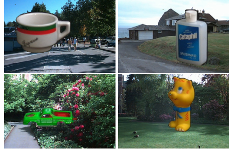
Figure 1. Synthetic database.

We compared the three graph kernels we presented in this paper (Eq. (1), (2) and (3)) in the context of interactive object retrieval. Each retrieval session is