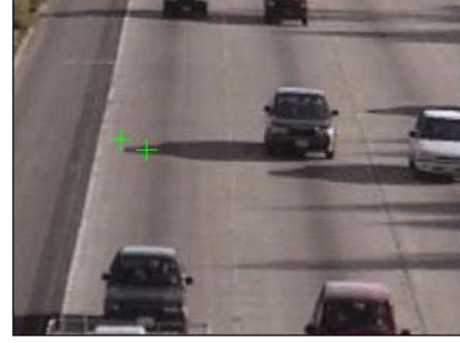
Fig. 1 Collect training data according to the center of green crosses.

The left cross indicates the transition between background and shadow and the right cross indicate the transitions among all three states. These two positions can represent the relationship among those states successfully. For each position we will collect two sequences at different time. And totally 4 training sequences are used.