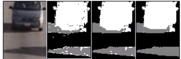
Fig. 3 Enhancement result. Left to Right: Original image, after passing through HMM, after passing through filters, after morphological operations.

After applying Viterbi algorithm, we compose the states information of each pixel together to build a direct result from HMM. However, there are still some noises. To solve this problem, we first employ median filter to eliminate small noise point and then using area threshold upon connected component to remove larger noise blob. Finally perform the morphological operation to fill the hole in object. Fig. 3 shows an example of such enhancement.